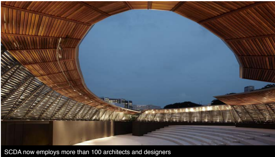
SCDA now employs more than 100 architects and designers