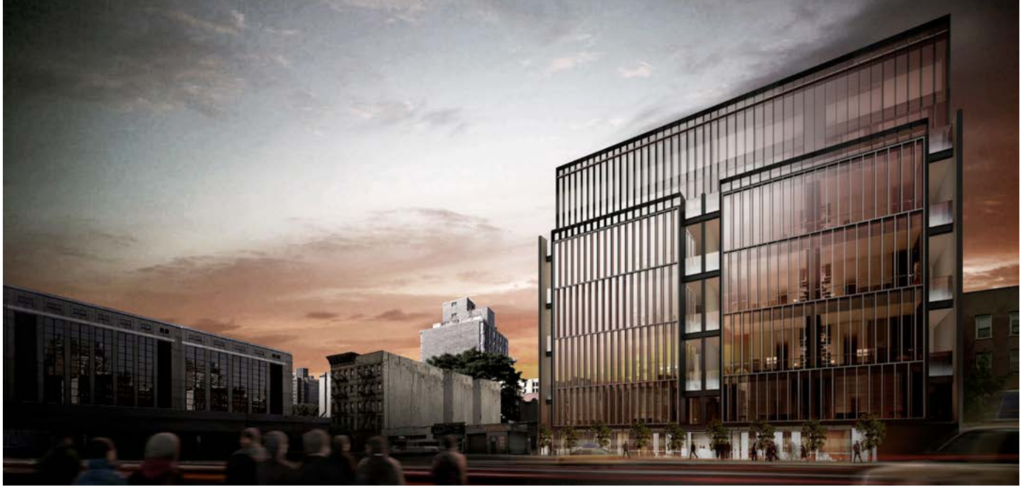
Condos With a Watery Theme

Condos With Pools and Huge Art Along the High Line