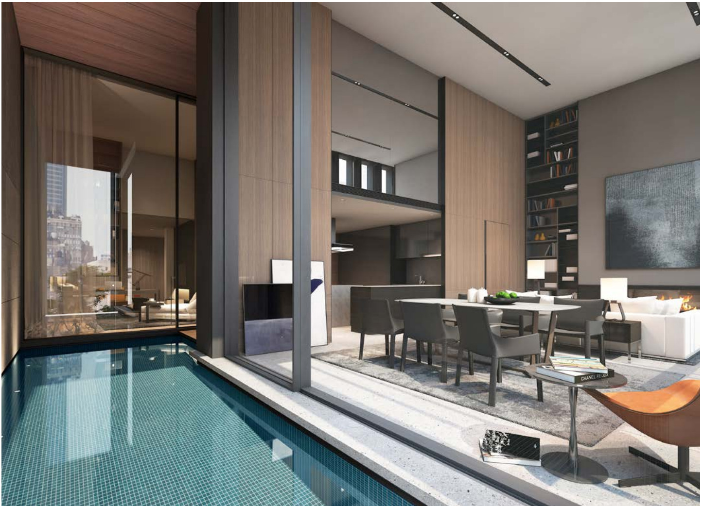
The Alcove pools, at most 24 feet long, will be more submerged contemplation of the cityscape than for serious laps.